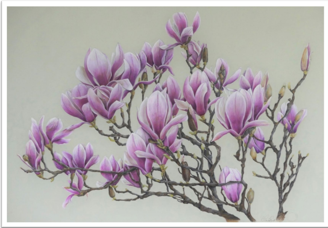
Magnolia x soulangeana by C Cansfield-Smith

During this two-day intensive workshop for beginners, students will be guided step-by-step through the basics needed to understand and enjoy the fascinating world of botanical art. Students will learn how to observe light and to be aware of tone in drawings, to sketch and compose and to understand the methods for mixing watercolours. The aim will be to draw a live plant specimen in order to apply the techniques necessary to render a fine painting. Students will leave with a finished painting and have the tools and techniques to continue with botanical art as a hobby.